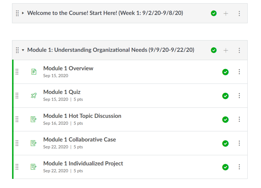
Image: A Canvas course site home page that is chunked into chronological modules with specific headings (e.g., Module 1: Understanding Organizational Needs), pages (e.g., Module 1 Overview with content information inside), and assignments (e.g., Individualized Project) to support students in their learning journey.

Limit deviations from your university's standard template (unless integral to your course design) and leverage campus-supported tools to enable students to more quickly acclimate to your course site and related technologies. In addition, arrange your "home" page in a chronological order with headings for weeks or modules with content, activities, and assessments with due dates clearly articulated. Have students new to the institution in your class? Make a short tutorial video showcasing how they can interact with the tools you want them to use in your course site!